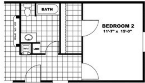
2 BEDROOM OPTION

Our home building facilities invest in continuous product and process improvements. Plans, dimensions, features, materials, specifications and availability are subject to change without notice or obligation. Renderings and floor plans are representative likenesses of our homes and may differ from the actual homes. We invite you to tour a Home Center near you and inspect the highest value in quality housing available or call (205) 384-4159 to speak with a Home Consultant. Copyright 2017, CMH. All rights reserved.