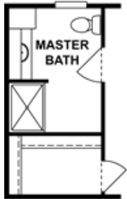
OPTIONAL 48" SHOWER BATH