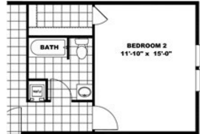
OPTION 2 BEDROOM

Our home building facilities invest in continuous product and process improvements. Plans, dimensions, features, materials, specifications and availability are subject to change without notice or obligation. Renderings and floor plans are representative likenesses of our homes and may differ from the actual homes. We invite you to tour a Home Center near you and inspect the highest value in quality housing available or call (205) 384-4159 to speak with a Home Consultant. Copyright 2017, CMH. All rights reserved.